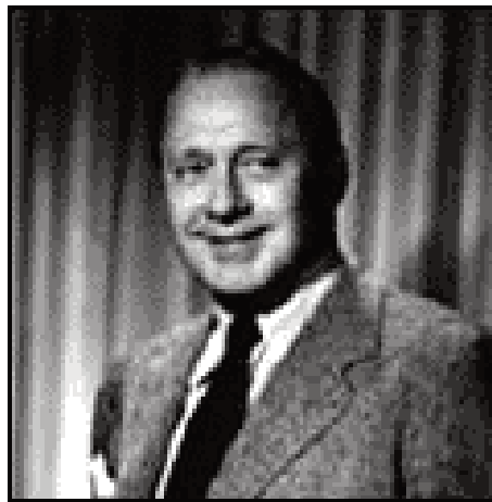
The Amos and Andy Show, half-hour version debuted 1943